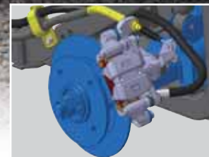
4-wheel disc brakes